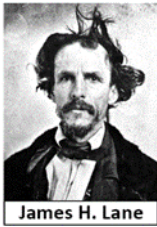
James H. Lane