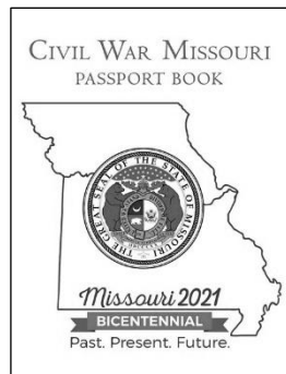
Cover of the Bicentennial edition of the Passport Book, released in 2021