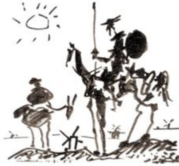
Picasso's Don Quixote