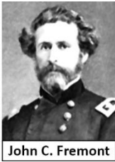
John C. Fremont