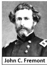
John C. Fremont