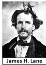
James H. Lane